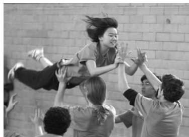
Olney students sometimes are more brave than Ohio YM Friends