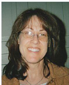
Denise Troy Historical Committee